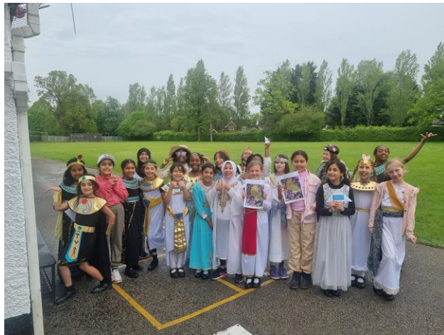
5 - Year 4