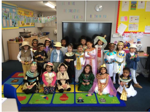
1 - Reception

They all looked amazing in their costumes, thank you for the wonderful effort!