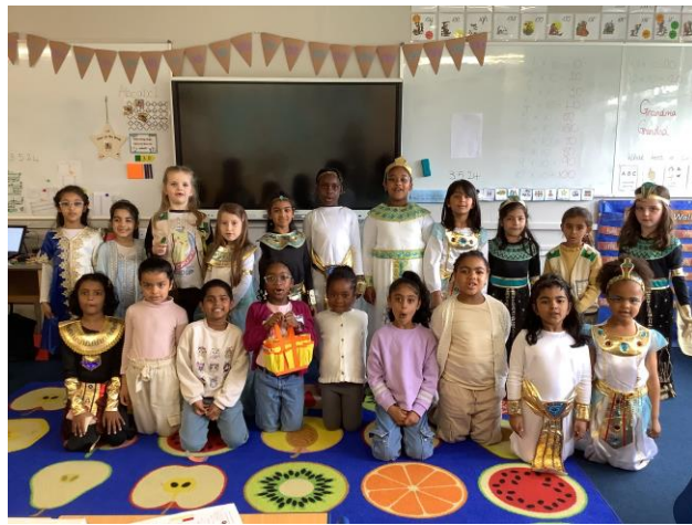
2 - Year 1