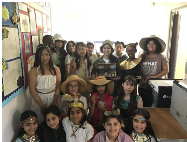
6 - Year 5