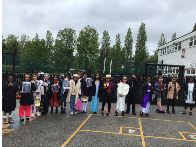
4 - Year 3