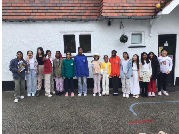
7 - Year 6