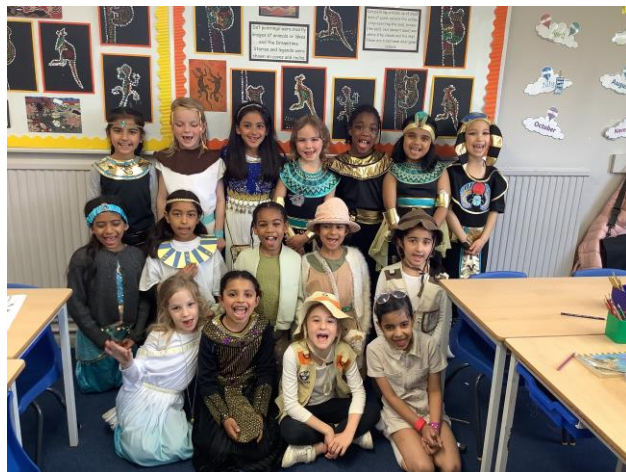
3 - Year 2