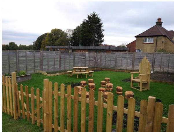
5 - After