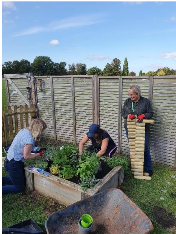
3 - Building of a herb garden