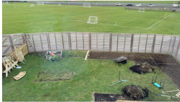
4 - Mid build