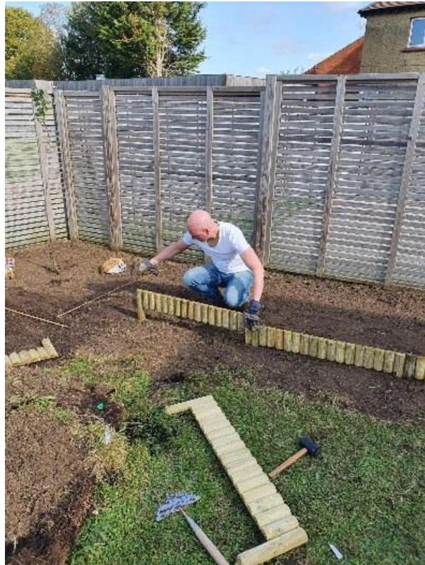
2 - Creating the vegetable beds