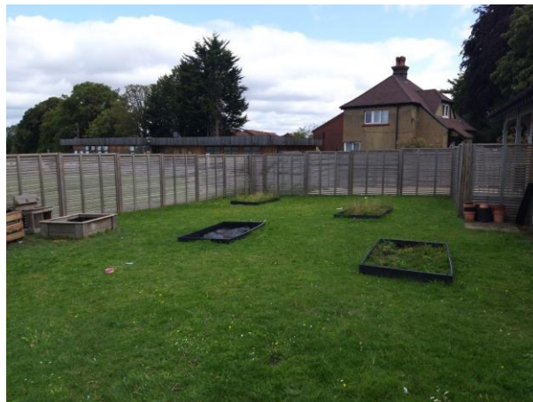
1 - Before