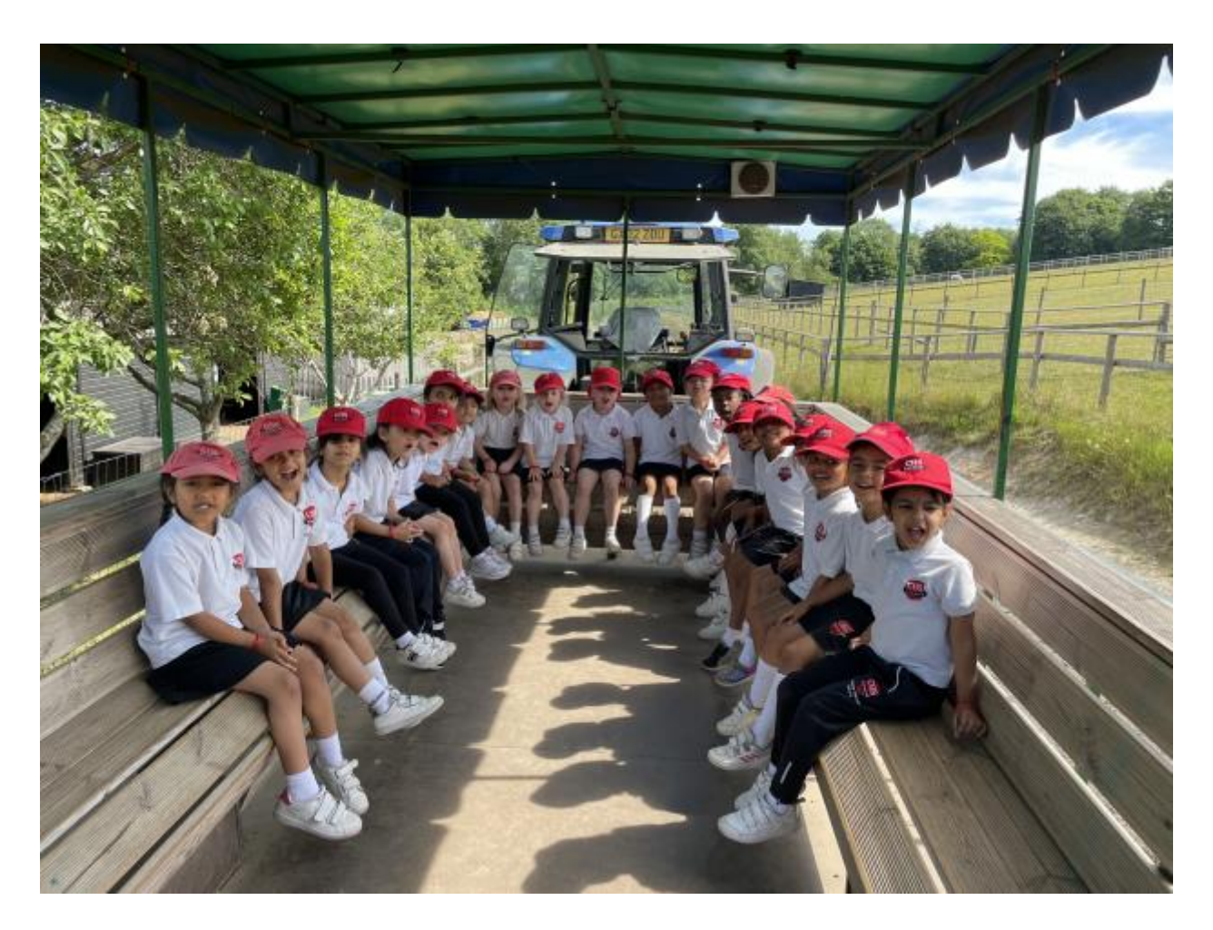
Girls' Newsletter - 24th June 2022