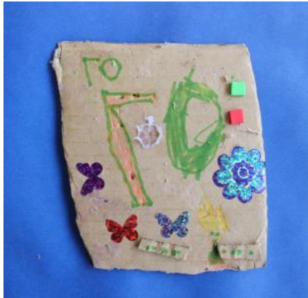
1 - Ava