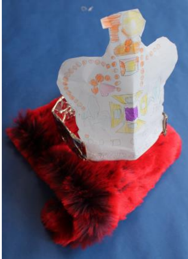
2 - Leila