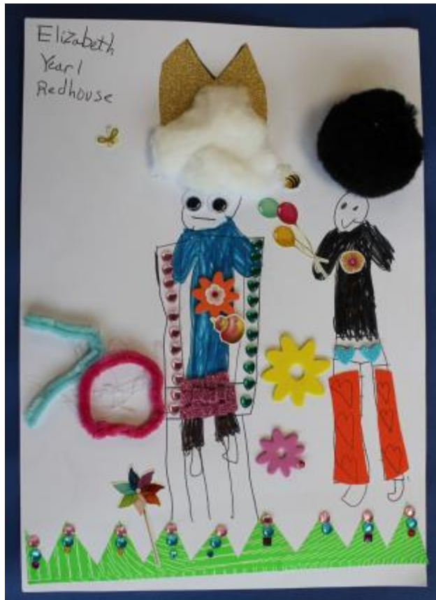
4 - Elizabeth