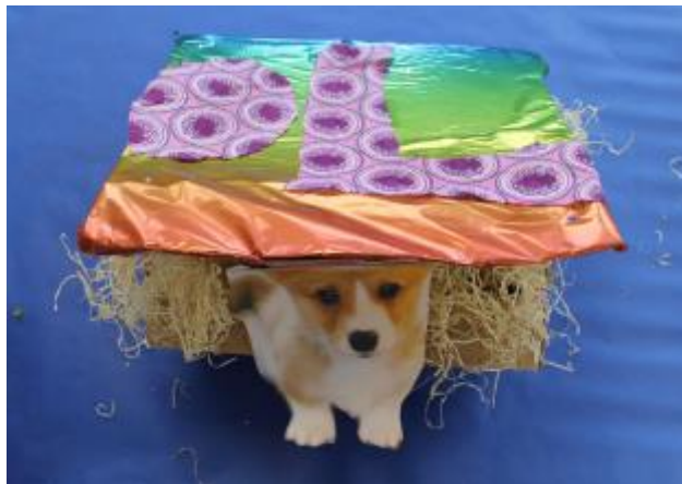
3 - Eden