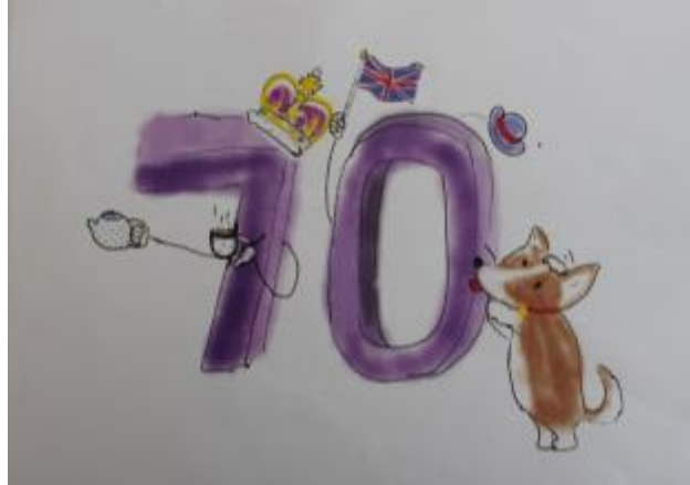
8 - Isabella N