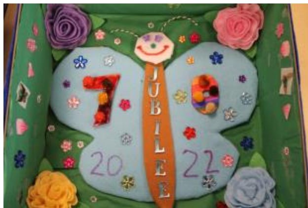
5 - Sophia