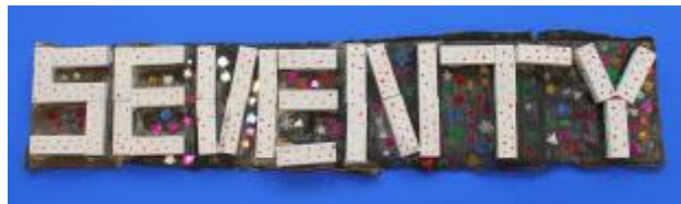
9 - Ishi