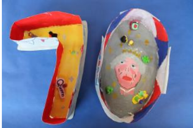
6 - Heidi