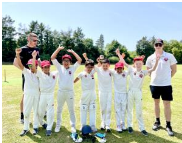
CHS Cricket Honours Board 2022

https://sway.office.com/Lt6lSZ9uGlsCmRCG#content=AUFUc2RUwKGZUQ