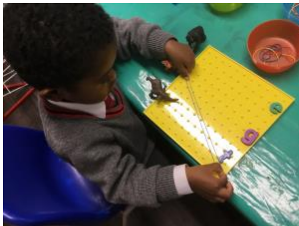
Purley Pre-School have been very busy learning about their current topic focusing on all different types of animals around the world. This week the children have been matching animals to their