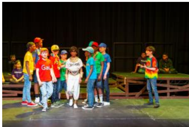
Over the last two evenings our boys performed ' Joseph and the Amazing Technicolour Dreamcoat ' at Caterham School . The cast were absolutely outstanding and thoroughly deserved the applause