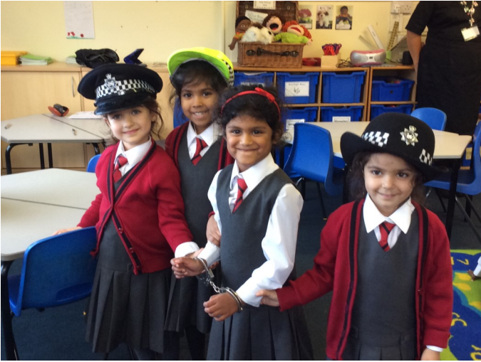
Crimes in Reception!