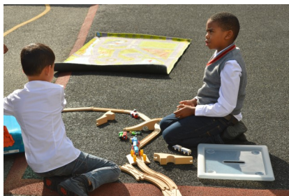
Class 2G get active outside in 'Golden Time'.