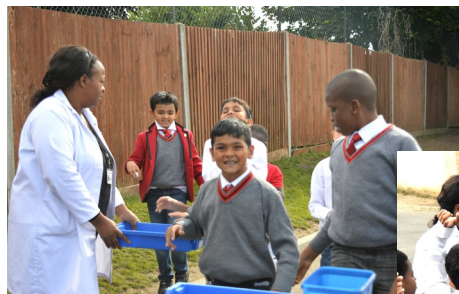
Year 4: Outdoor Science experimenting with solids, liquids and gases.