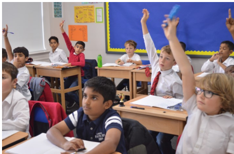
5D using adjectives to describe the feeling of the blitz! "It's terrifying, spine chilling and nail biting!"