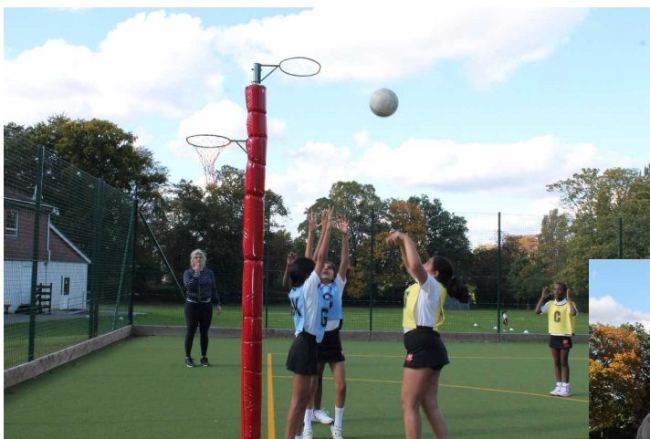
Practising their hoop skills on the netball court.