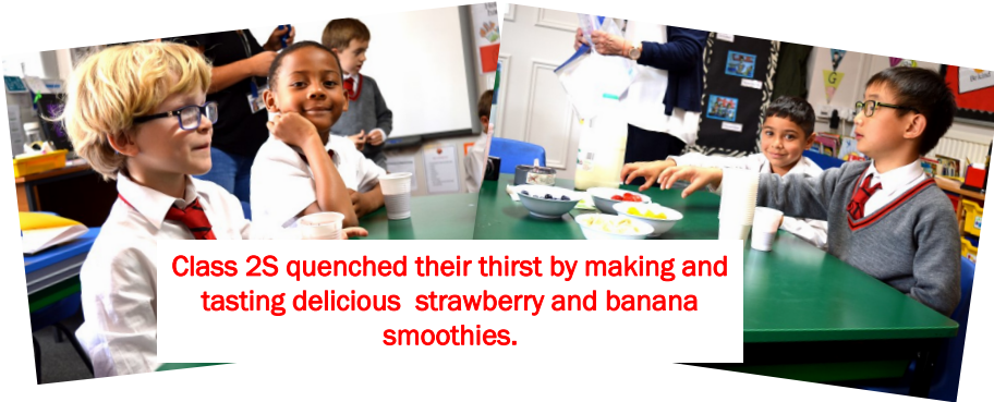
Class 2S quenched their thirst by making and tasting delicious strawberry and banana smoothies.