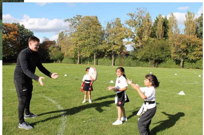
Nailing their skills in Tag Rugby.