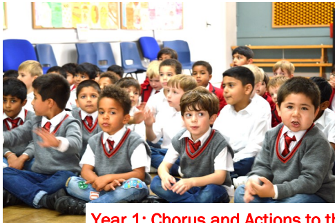
Year 1: Chorus and Actions to the Harvest song.

For our annual fund-raising for Jeans for Genes day, the boys enjoyed bringing in their donations and wearing their jeans for this fantastic cause.