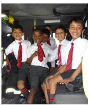
cab. They even had a go at using the hose!

Following the Year 2 topic on 'The Great Fire of London' we thought about what we would do if there was a fire. So on Monday afternoon fire fighters from the fire station in Croydon came to school to give the Year 2 boys a talk about fire safety. They were also shown around the fire appliance and were able to sit in the